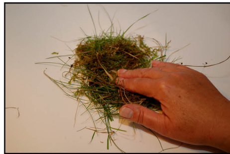
STEP 2: STICK GRASS ONTO CARDBOARD