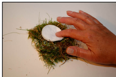
STEP 4: STICK COTTON WOOL PAD ONTO GRASS