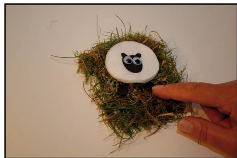
STEP 8: CUT OUT THIN RECTANGLES OF BLACK CARD TO MAKE LEGS