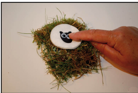
STEP 7: STICK GOGGLE EYES ONTO CARDBOARD FACE