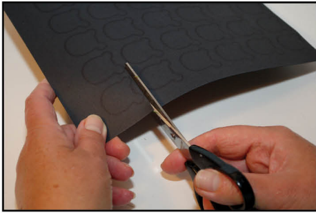
STEP 5: CUT OUT FACE FROM TEMPLATE