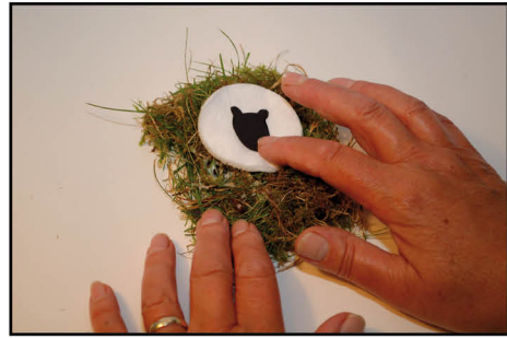
STEP 6: STICK FACE ONTO COTTON WOOL PAD