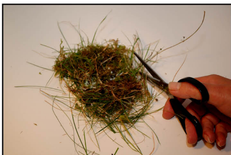
STEP 3: TRIM GRASS OFF THE EDGES IF NECESSARY