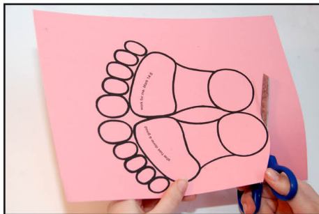
STEP 1: CUT OUT TEMPLATE 1