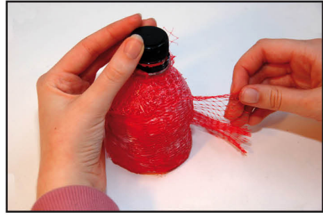
STEP 6: ADD ADDITIONAL DECOARATION