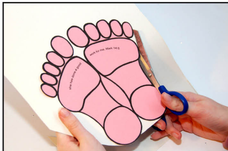
STEP 3: CUT AROUND FEET