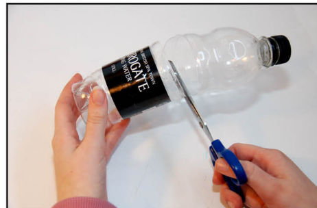
STEP 4: CUT OFF THE HEAD OF A BOTTLE