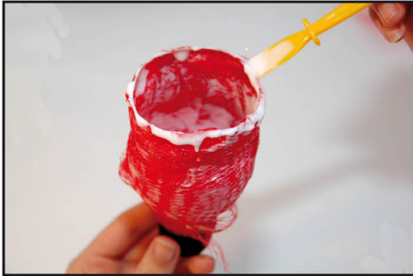
STEP 7: GLUE RIM OF BOTTLE