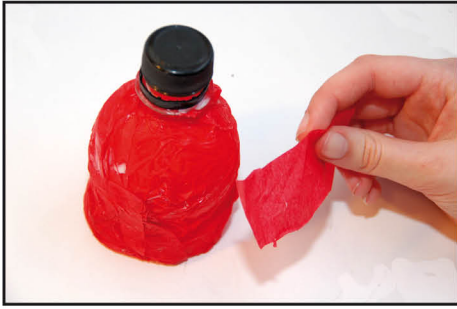
STEP 5: GLUE ON TISSUE PAPER TO BOTTLE