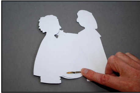
Step 5: Open up the split pin or paper fastener on the back.