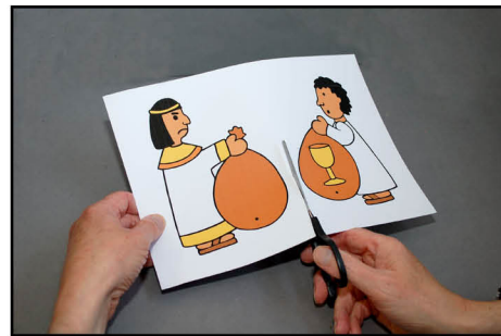
Step 2: cut out template.