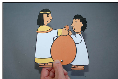
Step 4: push split pin or paper fastener through the black dots.

Tip: sometimes it helps to push a pun through the dots first.