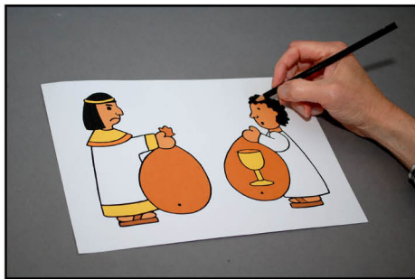
Step 1: colour template.