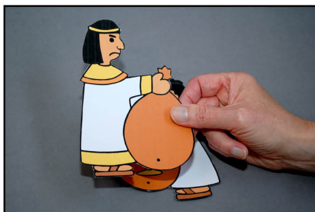
Step 3: lay two sacks on top of one another aligning the black dots.