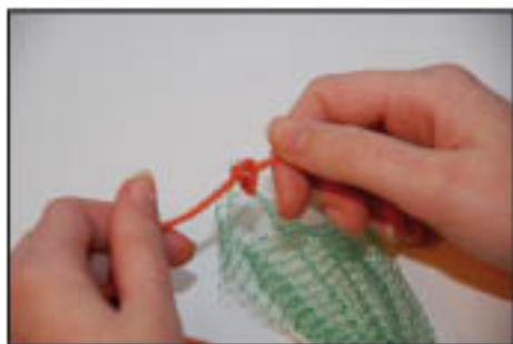
STEP 3: TIE YARN ONTO A HOLE IN THE NET