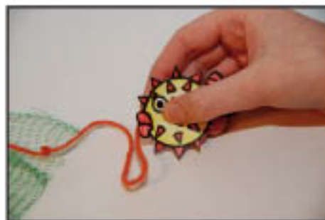
STEP 4: TAPE A FISH TO THE OTHER END OF THE YARN. RE- PEAT FOR ALL THE OTHER FISH