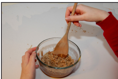
STEP 3: STIR IN SHREDDED WHEAT OR CORNFLAKES