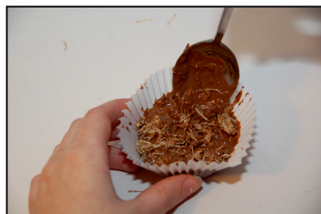
STEP 4: SPOON MIXTURE INTO A CAKE CASE