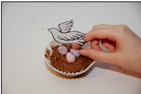
STEP 7: STICK EGGS INTO THE NEST