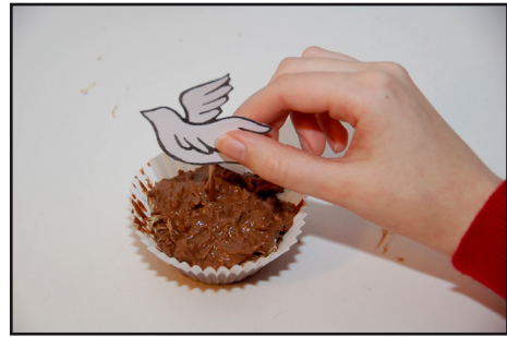
STEP 6: STICK THE TOOTHPICK INTO THE NEST