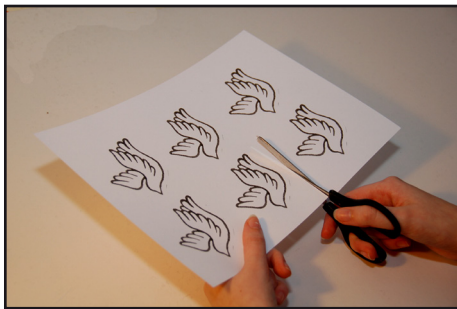
STEP 1: CUT OUT A BIRD