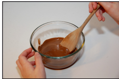
STEP 2: MELT CHOCOLATE INTO A BOWL