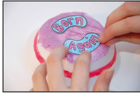
STEP 6: STICK WRITING ON TOP OF TISSUE