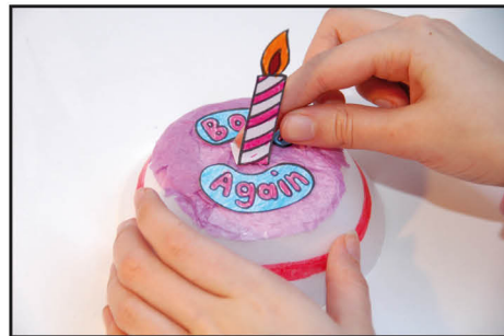
STEP 8: STICK TAB ONTO CAKE IN THE MIDDLE OF THE WRITING