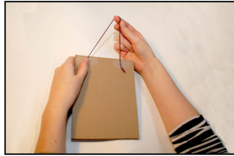
STEP 6: TAPE THE YARN ON THE BACK TO MAKE A HANDLE TO HANG IT