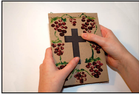
STEP 5: STICK CROSS IN THE MIDDLE OF THE CARD