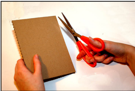
STEP 1: CUT RECTANGLE OF THICK CARD