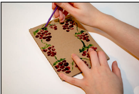
STEP 3: PAINT A GREEN VINE BETWEEN THE GRAPES, ACTING AS A BORDER