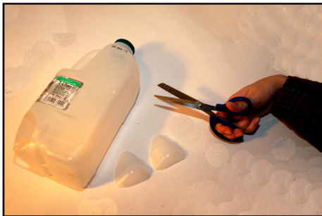
STEP 1: CUT OFF TWO CORNERS OF PLASTIC MILK BOTTLE