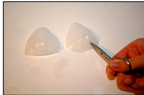
STEP 2: MAKE TWO HOLES ON THE BACK OF EACH CORNER