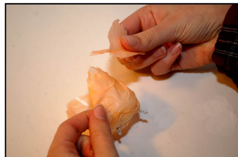
STEP 4: GLUE TISSUE PAPER ONTO EACH CORNER