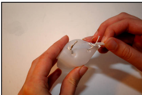
STEP 3: USE TWIST TIES OR YARN TO TIE THE TWO CORNERS TOGETHER