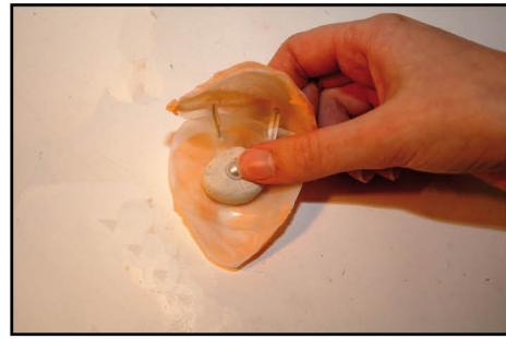
STEP 6: EMBED PEARL INTO CLAY

KNOWING GOD IS THE MOST PRECIOUS THING IN THE WORLD, AND IT'S MORE IMPORTANT THAN ANYTHING ELSE