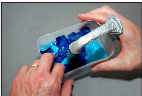
STEP 11: PUSH THE REST OF THE TISSUE PAPER INTO THE BASE OF THE MILK CARTON