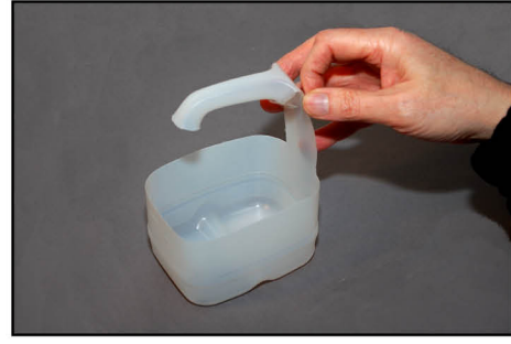
STEP 6: TAPE THE HANDLE IN PLACE BY WRAPPING TAPE AROUND THE BENT CORNER