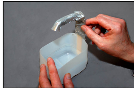
STEP 8: COVER THE TAP SHAPE IN SILVER TISSUE PAPER OR TIN FOIL