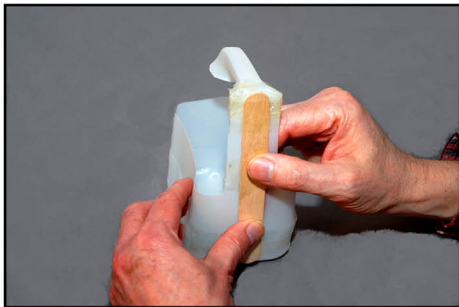
STEP 7: TAPE A LOLLY STICK, POPSICLE STICK OR TONGUE DEPRESSOR ONTO THE BACK OF THE CARTON