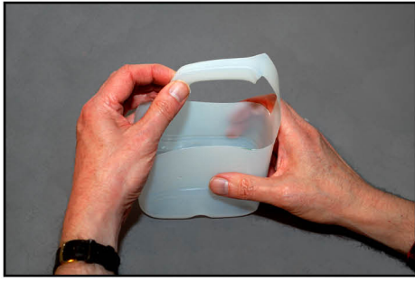
STEP 5: BEND THE HANDLE DOWN AT A RIGHT ANGLE